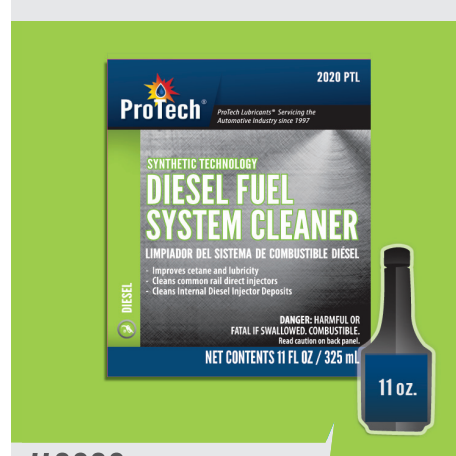
##2020 DIESEL FUEL SYSTEM CLEANER (TANK)